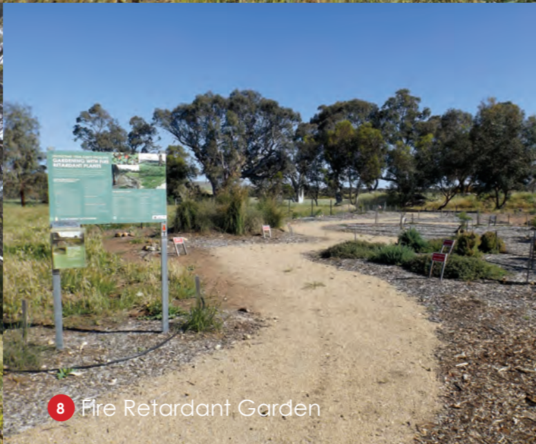
8 Fire Retardant Garden