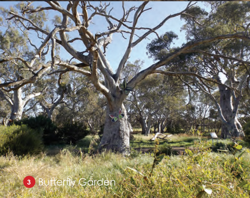
3 Butterfly Garden