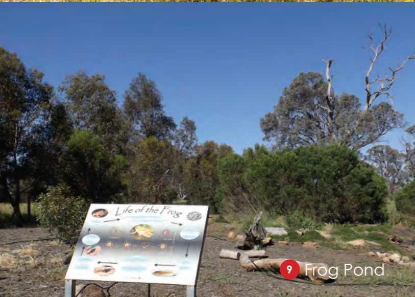
9 Frog Pond