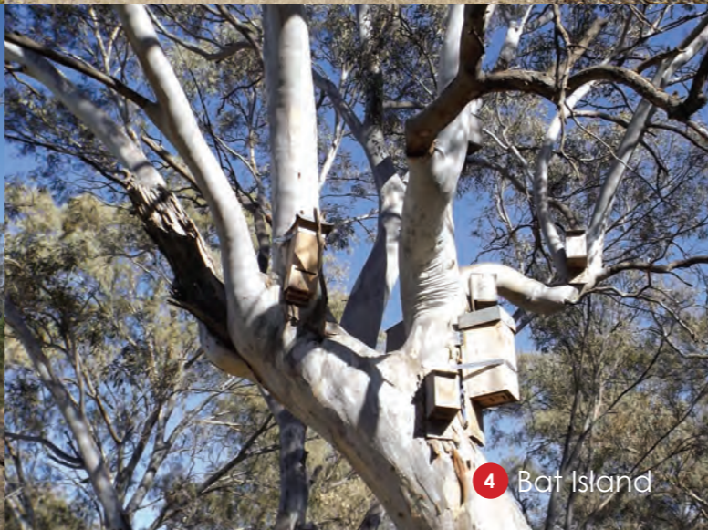
4 Bat Island