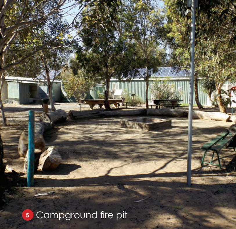
5 Campground fire pit