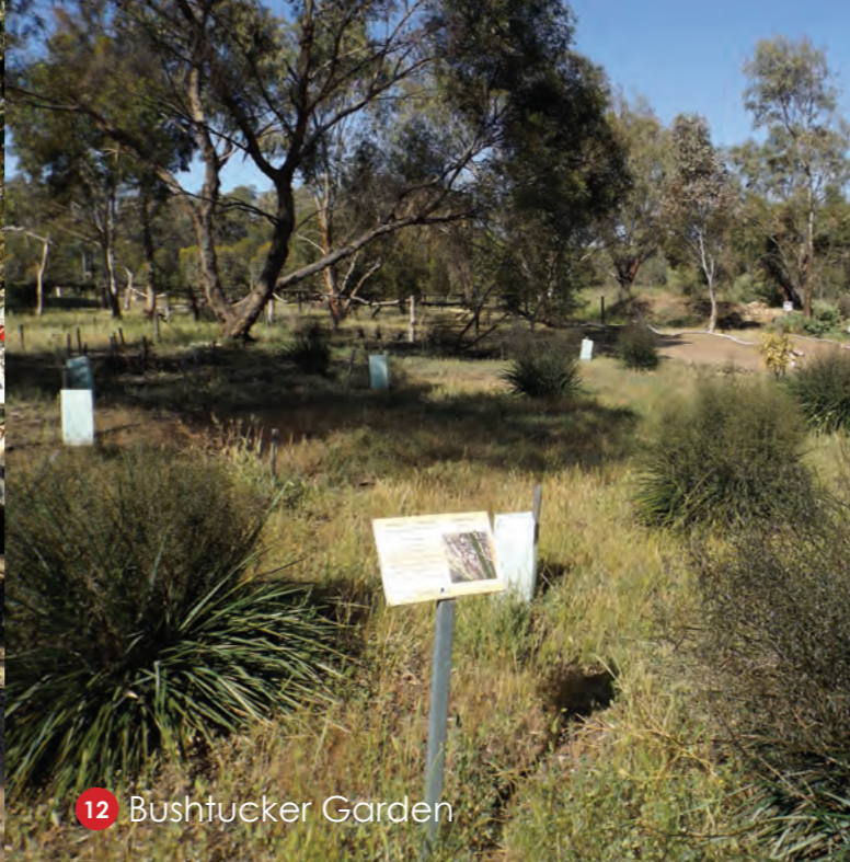
12 Bushtucker Garden